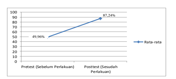
Figure 1. Diagram of Understanding the History

The understanding of the establishment of the Abbasid dynasty of students is explained in the picture below.