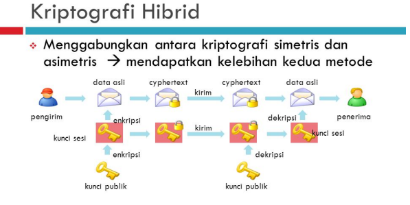
Figure 4. Application of Hybrid Cryptography

In Figure 3 below, we can see the combination of cryptographic processes of hybrid one time pad (OTP) and keyed-hash message authentication code (MAC).