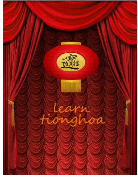
Figure 3. Splash Screen