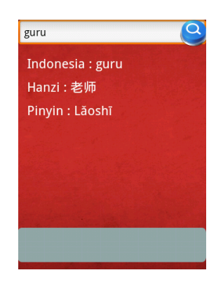
Figure 9. Kamus

This page is a dictionary page. This page is used to search for words in hokkien. There is an editview and a button. This page is only for searching words from Indonesian into Hokkien.