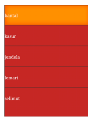
Figure 5. Category

This page displays a list of categories of Lessons related to the topics discussed. The list is a menu to proceed to each link to find out material from the selected category.