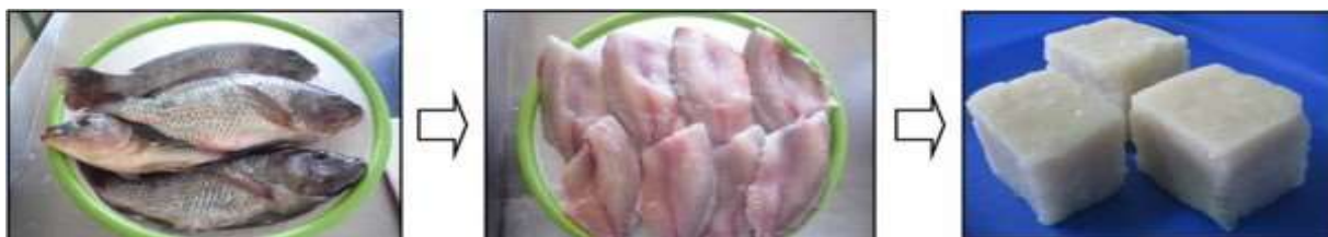
Figure 3. Surimi Processing Process in Tobasa District

To overcome the above problem, the Government has developed surimi process technology made from tilapia ( Oreochromis niloticus ). Tilapia, known as a white fleshy fish and very resistant to changes in the environment, because its body is dense and thick meat. Tilapia can be widely cultivated in Tobasat Regency at Lake Toba, so it is very potential to become a sustainable source of raw material for the fish processing industry.