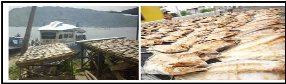
Figure 4. Salted fish industry in Tobasa Regency