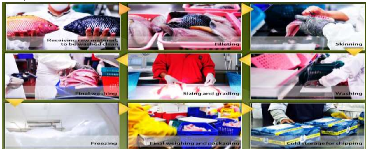
Figure 5. Flow of Fillet Fish processing

One of the freshwater fish fillet companies is PT. Aqua Farm Nusantara. Fish fillets will be exported to the United States and Europe.