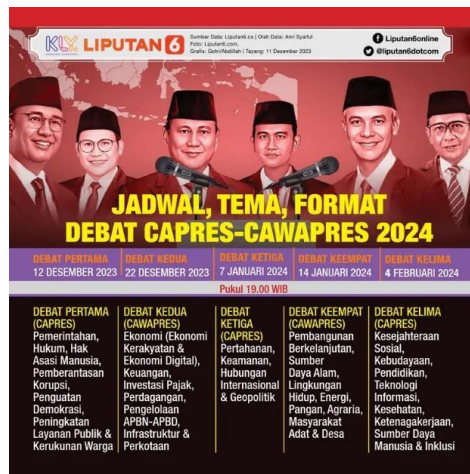
Figure 1. Schedule, Theme, Format of the 2024 Presidential Debate.

and two Vice President debates. The following is the schedule and theme of the 2024 presidential and vice-presidential debates.