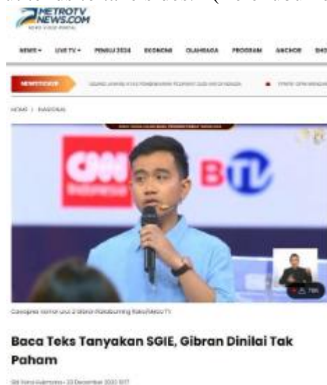
Figure 3. Schedule, Theme, Format of the 2024 Presidential Debate.

Mass media becomes a forum for political competition. Political figures who declare themselves through candidacy in the general election are currently vying to build publicity or fame through the existing media. Mass media plays an important role in shaping perceived views through reporting. This understanding of reality can be interpreted as an attempt to describe interpretations of certain events, situations, and topics, including in a political context. The reality presented by the mass media certainly influences people's views and opinions to view a political phenomenon. McComb and Shaw argue that audiences not only access news and other information through mass media, but also to find out how much meaning is given by the media in giving emphasis to a particular issue or topic. argues that the influence of the media in setting public attention depends on the center of power; If the media has close ties to the elite class in society, it is likely to influence the media's agenda as well as society's agenda. (2014:418). (Anggoro, 2014) (Silviana & Martanto, 2019) (McQuail & Windahl, 1993) Littlejohn & Foss