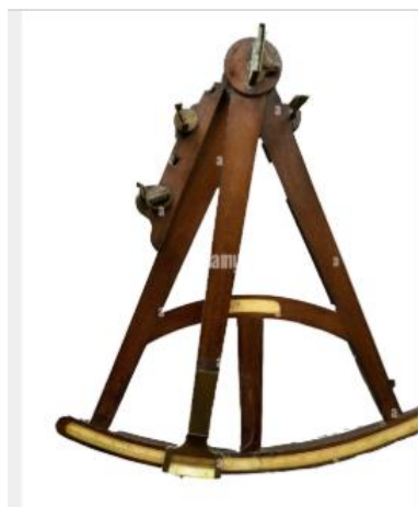
Figure 1. The sextant used by John Hadley

The sextant was first introduced and used by British astronomer and mathematician John Hadley in the early 18th century, marking a significant breakthrough in navigational science. One of its primary functions was to measure latitude and longitude, particularly in the vast and often uncharted expanses of the world's oceans (Figure 1). Before the sextant, sailors relied on earlier tools like the astrolabe or cross-staff, which were less accurate and more difficult to use in unstable conditions aboard a moving ship. As a result, navigation was often based on rough estimations that increased the risk of error, shipwreck, or becoming lost at sea.