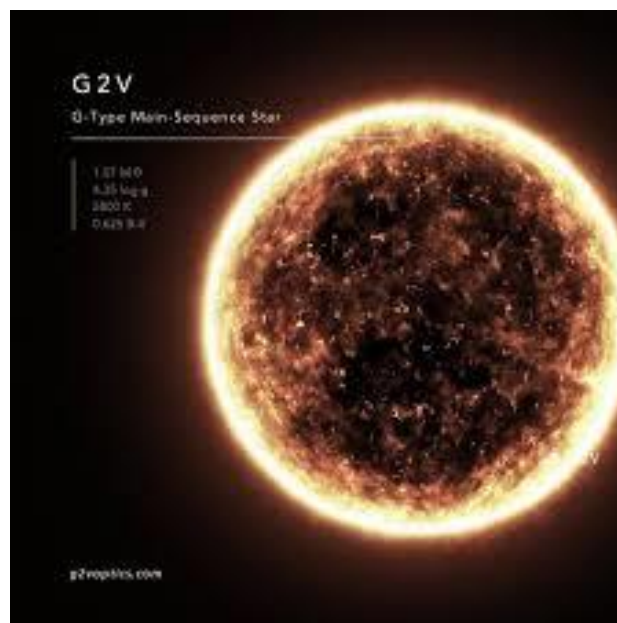
Figure 1. Suns Type G2V

"Idza asy-Syamsu Kuwwirat", which, according to the mufasir, indicates the disappearance of the sunlight or a drastic change in its physical condition. Classical interpretations, such as the works of Ibn Kathir and al-Tabari, understand the word kuwwirat as the process of being "rolled up", "dimmed", or "dropped", while contemporary interpretations emphasize aspects of cosmic transformation as part of the series of events of the Day of Resurrection [1].