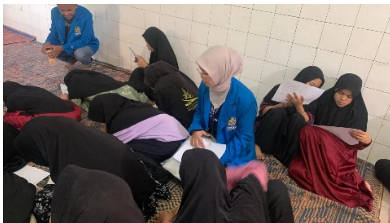
Figure 2. Interview with orphanage children

The first stage of the students asked permission from the head of the foundation and the caregiver to carry out activities at the orphanage. In the second stage, students made initial observations of orphanage children who had a history of skin diseases. In the third stage, students conducted experiments on making sulfur soap by referring to trusted reference journals. This experiment was carried out to get the best results from sulfur soap and to make sulfur soap in bulk. The implementation stage of the practice of making sulfur soap at the orphanage was carried out after obtaining permission from the orphanage management.