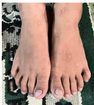
Figure 4. Before soap use

In addition to the physical results, improvement was seen in bathing frequency which increased from an average of 1x to 2x a day voluntarily. The children also started asking for the soap themselves, signaling positive acceptance of the product.