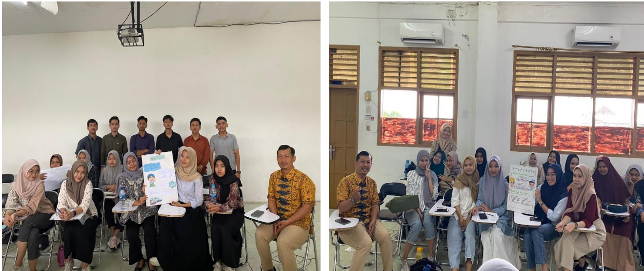
Gambar 3. Dokumentasi bersama mahasiswa di kelas

Third , the used calendar media used still needs to be developed sustainably so that the results obtained can be maximized and requires further research. Used items (calendars that are no longer used) can be reused.