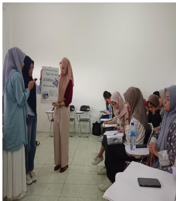
Gambar 2. Mahasiswa presentasekan materi al-islam dan kemuhammadiyahhan