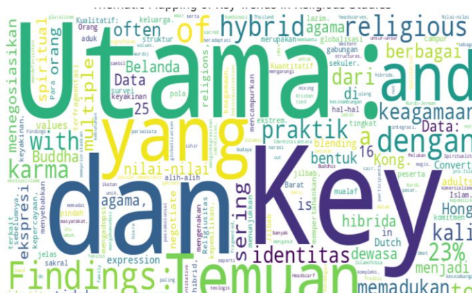
Gambar 3. Thematic Mapping

Keyword analysis identified recurring themes such as "hybrid religiosity," "digital spirituality," and "influencer culture." Emerging trends included the ethical challenges of commodified spirituality and the role of artificial intelligence in enhancing digital religious experiences. Thematic maps revealed a shift from descriptive studies to analytical frameworks exploring the long-term impact of social media on religious practices.