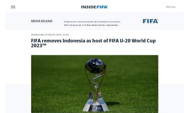
Figure 1. Headlines media release FIFA

the principle of fairplay used by FIFA. This then received attention from President Joko Widodo who responded through a video release with the statement "jangan mencampur adukkan politik dengan sepak bola" . This certainly raises many pros and cons among the public and football fans.