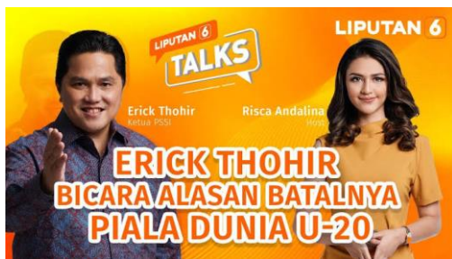
Figure 3. Liputan6 Talks Episode with Erick Thohir.

While Liputan6 Talks is a contextual news programme so the selection of topics in this programme also looks at the background of the topic being discussed. Liputan6 Talks is a news programme that is conceptualised with in-depth and more detailed questions and answers about a topic that is happening to the relevant expert sources.