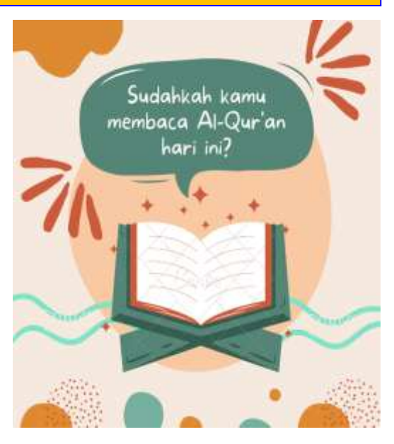
Figure D.2 Media Poster Design Features with Canva

A poster was presented in this study and can be displayed below: